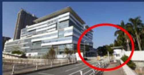
Specimen Collection Point 樣本瓶收集處